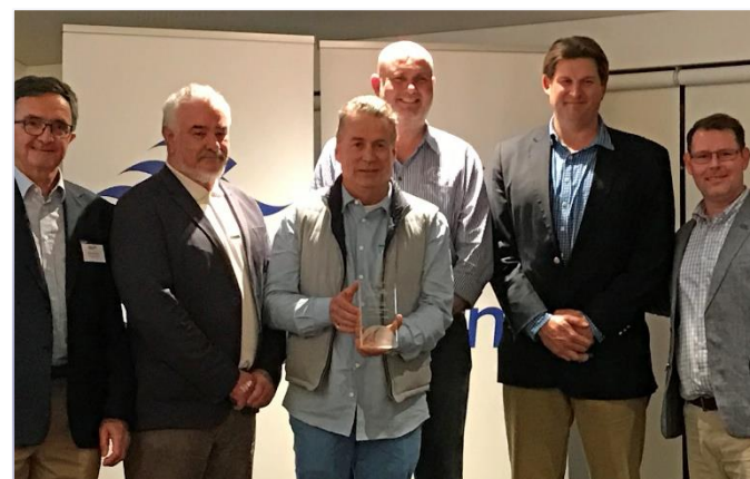
Sports Promotion Award Invictus Games Team winners