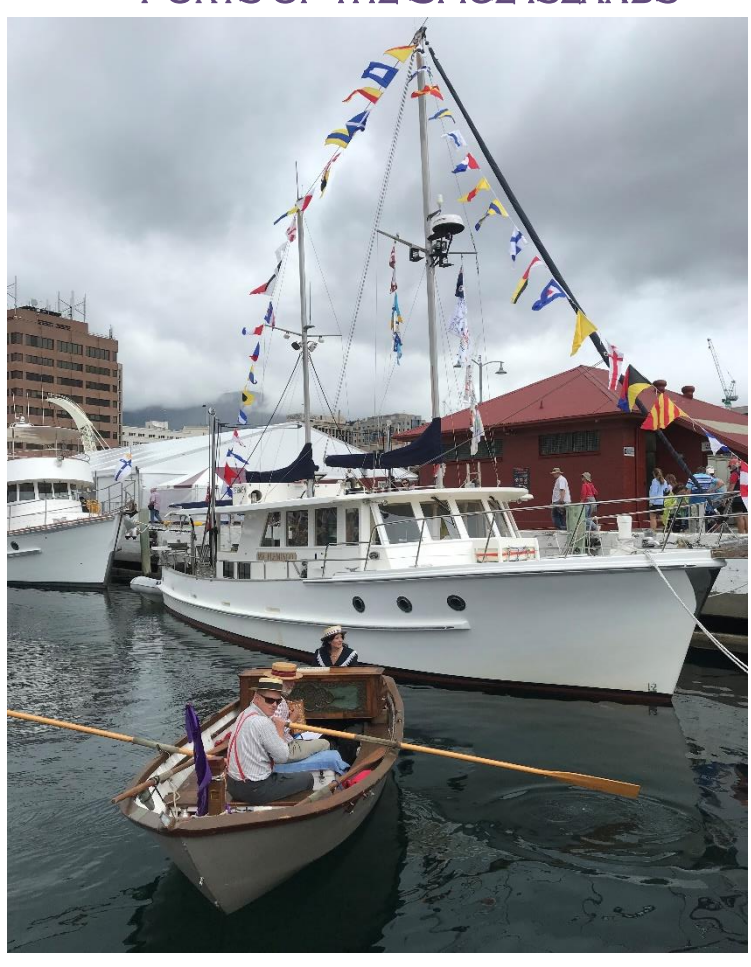
Flemingo in place as an exhibit at the Wooden Boat Festival with the entertainment vessel in the foreground.