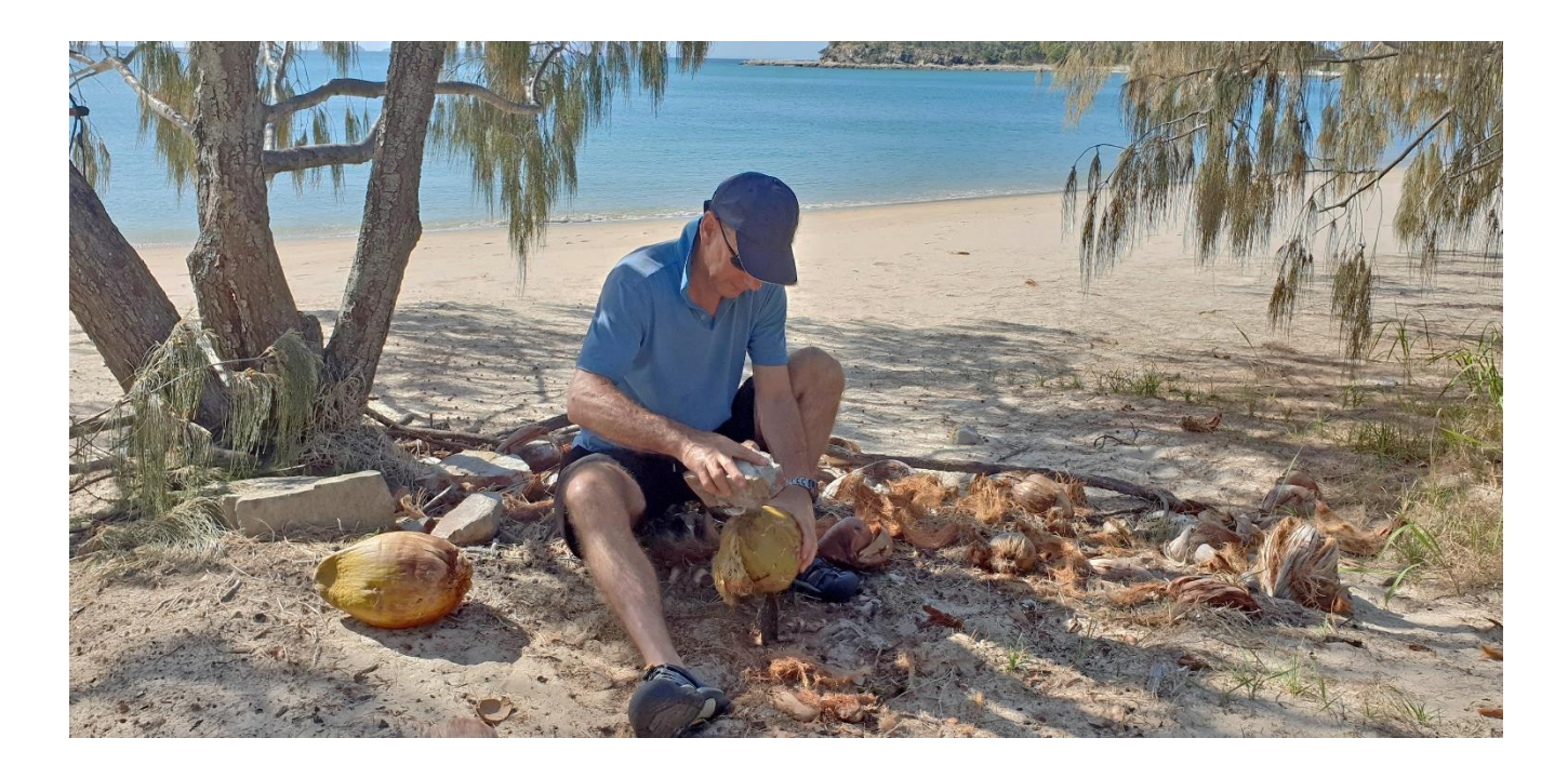
The winning photo for March is called 'Ship wreck practice on Great Keppel'

Each Month the best photo received will be published and, in the running, to win a new Mystery Prize at the end of 2019.