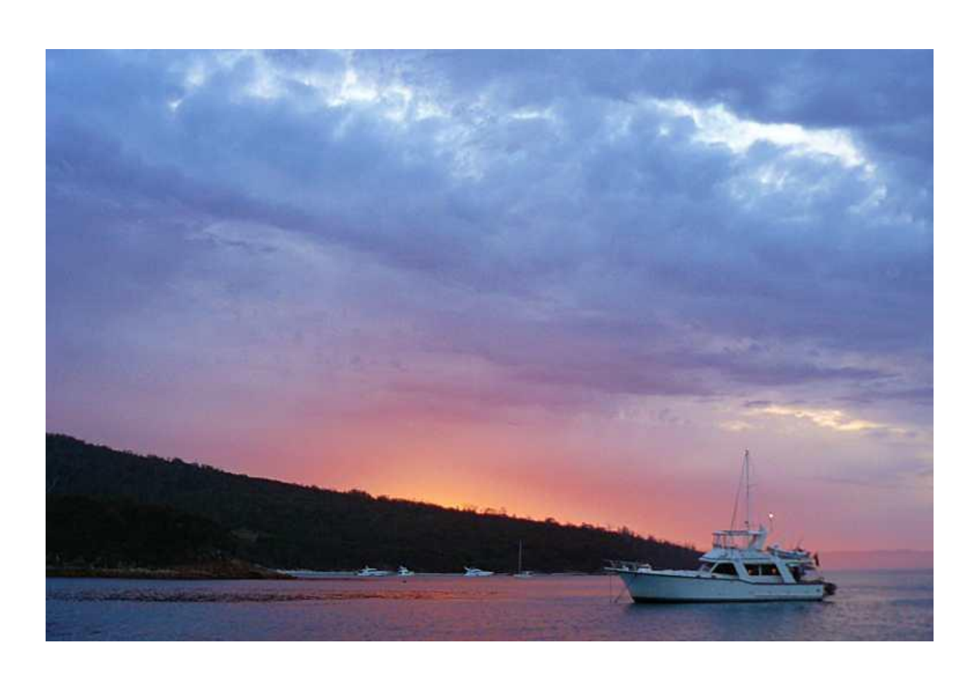
Sunset at Crocket's Bay, Schouten