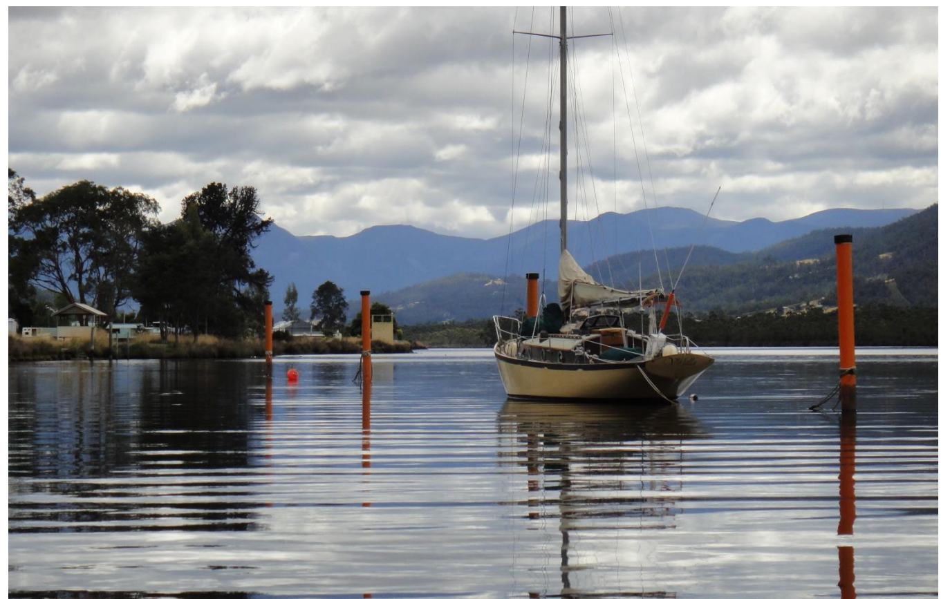
'The Peaceful Huon'