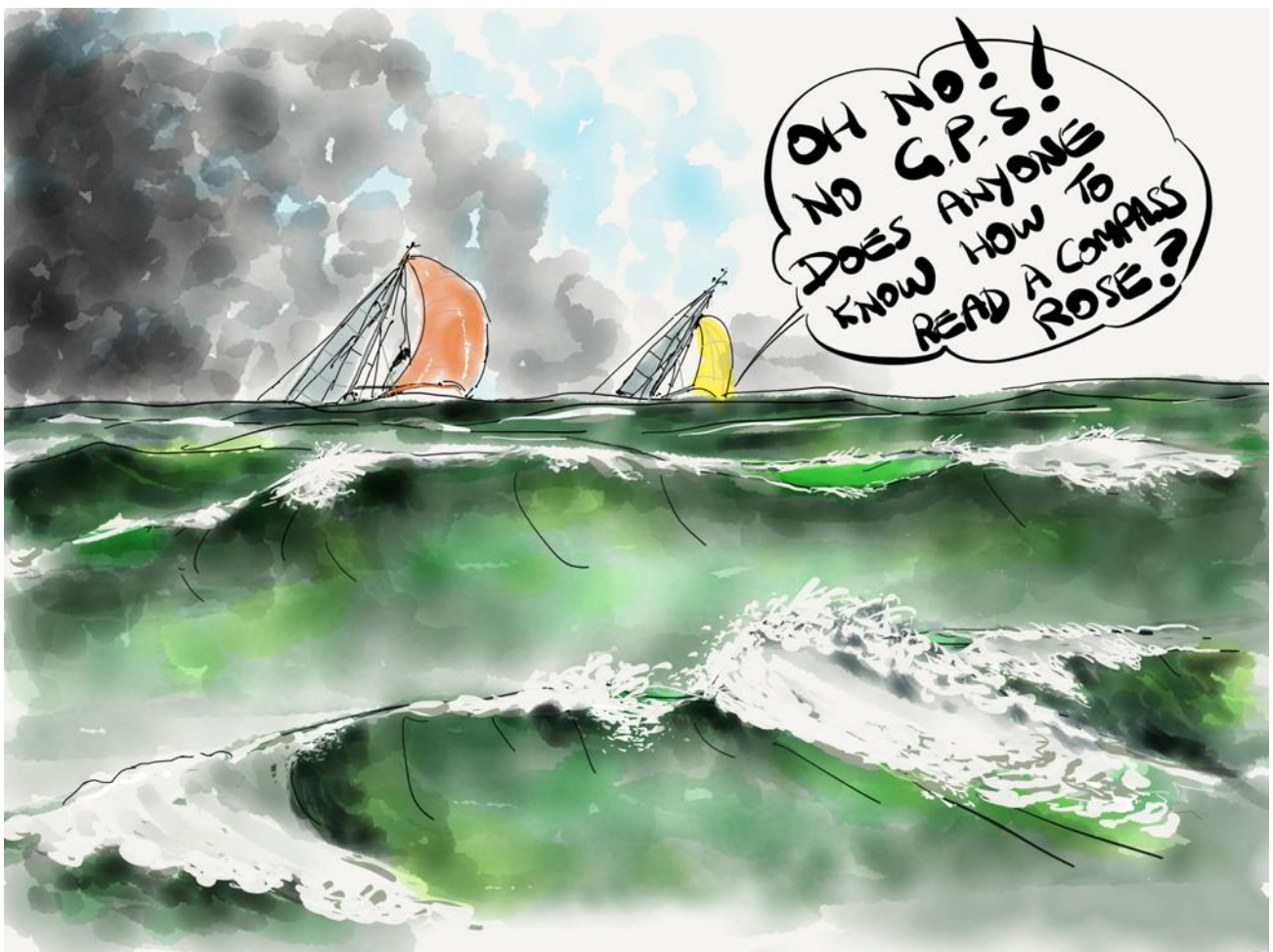
Another fine cartoon by Alex Comino

We're improving the waving list for Cruising at MHC, and you can check your details at https://cruising.myhc.com.au/boat-register .