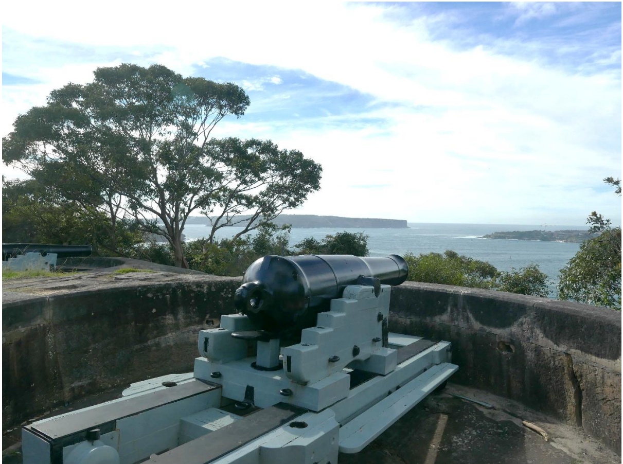
Borders are closed – 19 th Century solution