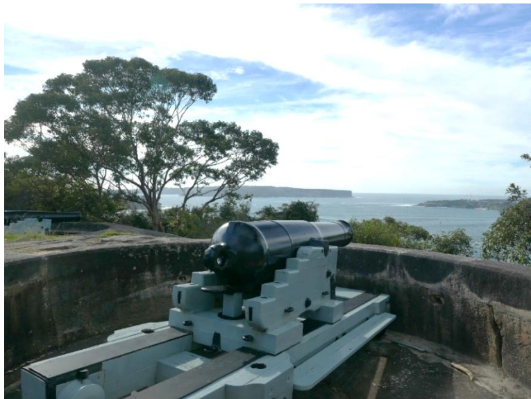
One of the old 68 pounders at Georges Heights. Sydney Heads in the distance.

Until 1851 and the Gold Rush. War with Russia three years later gave added impetus. Construction actually started on a new battery at Middle Head, but as the war faded, so did the plans. It was 1870 before they got serious again. A road was hacked out of the bush between Blues Point and Middle Head by unemployed labourers (today's Military Road) to move the big guns out to the headland. The barrels—each 3 metres long and weighing nearly 6 tonne—were wrapped in timber beams and rolled down the rough road by 250 soldiers. ' Such a crop of broken and twisted limbs, sprains and severe flesh wounds was seldom known before ' noted the major in charge. 1874 there were seven big guns sited at Inner Middle Head facing ENE to the Heads, and four more at Outer Middle Head looking southeast across to Sow and Pigs. Another battery was built up on Georges Head, and this has been restored and can be seen today. These 68 pounders could put a 30-kilo cannonball out to 3000 metres; exactly the distance from Outer Middle Head to the rock shelf off North Head that Gavin tried hard to ram on several occasions in dear old Delphin .