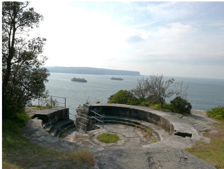
One of the sites for the 10 inch guns at Outer Middle Head, 80 metres above sea level.

For the bored gunners here and at North and South Heads stuck far from the city's lights, discipline was a problem. Within a few years of being formed, of the 1000 artillerymen, nearly 400 had deserted and many more were charged with drunkenness, sleeping on duty or striking superior officers. Part of the problem was there was nothing to shoot at. From when the first guns were installed at Middle Head in 1801 to the disbanding of the coastal artillery in 1962, they never got the chance to fire once in anger. But their deterrence worked.