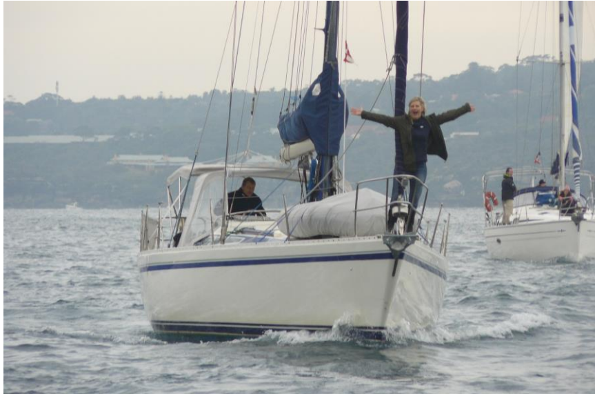
Tonic or is it Titanic off Chowder Bay

The June Queens Birthday Long Weekend saw 10 MHYC vessels depart the club Saturday morning and motor to Blackwattle Bay due to the light westerly breeze.