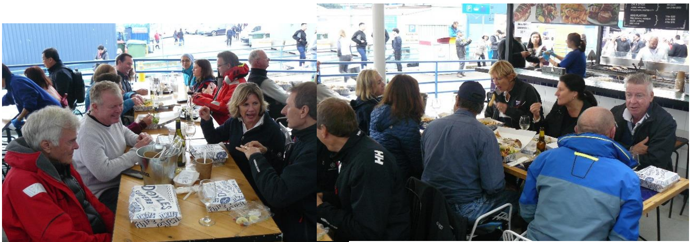
Doyles at the Fish Markets

After anchoring we headed to the Sydney Fish Markets for lunch. A number of members joined us on land. This saw 24 of us sitting down to lunch at Doyles.