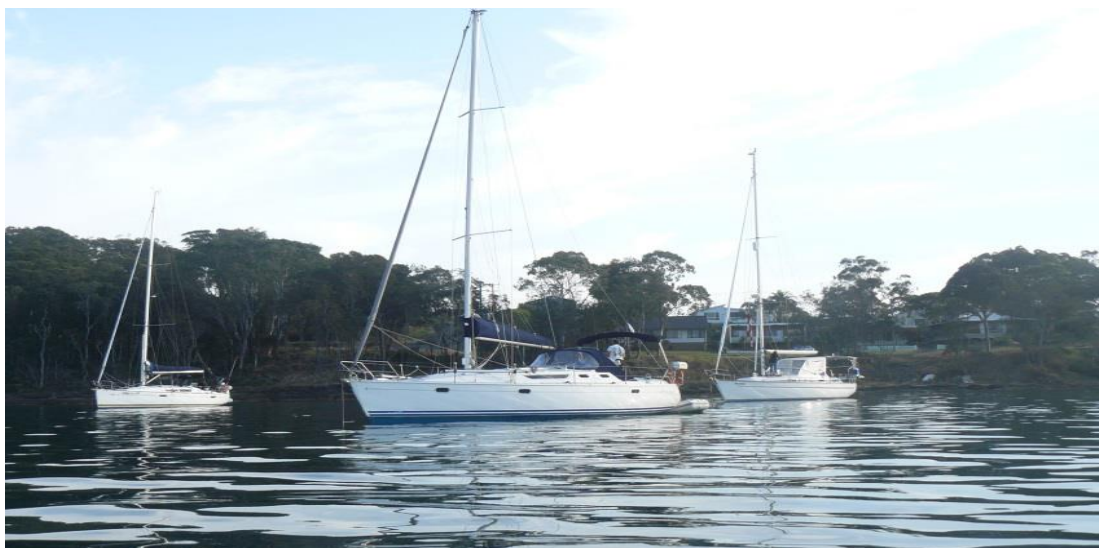
Slac-n-off, Buggalugs and Nashira on Lake Macquarie Oct 2017