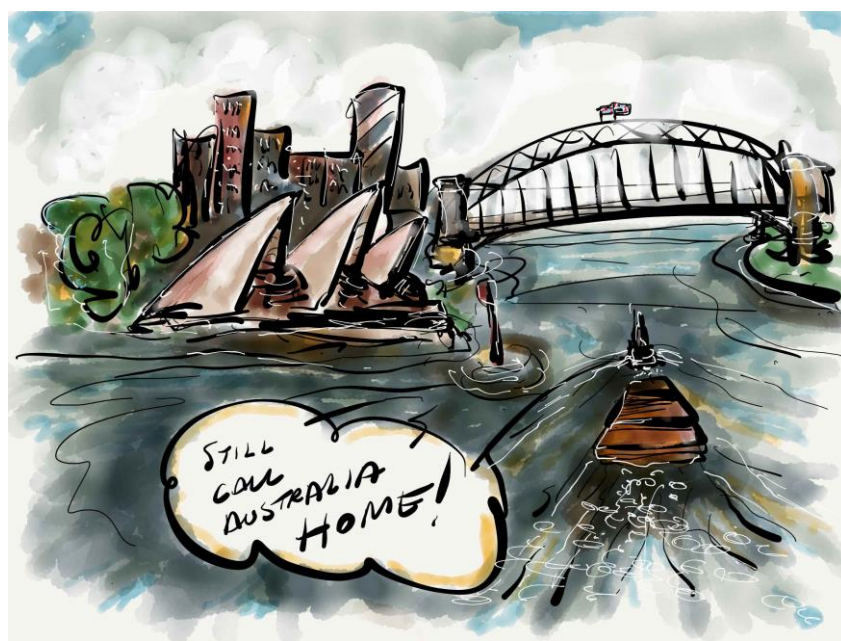
BY ALEX COMINO